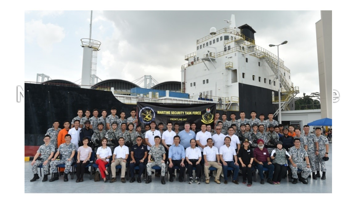
Group photo of the Members of ACCORD with the RSN's 180 SQN ASSeTs following the conclusion of their visit.