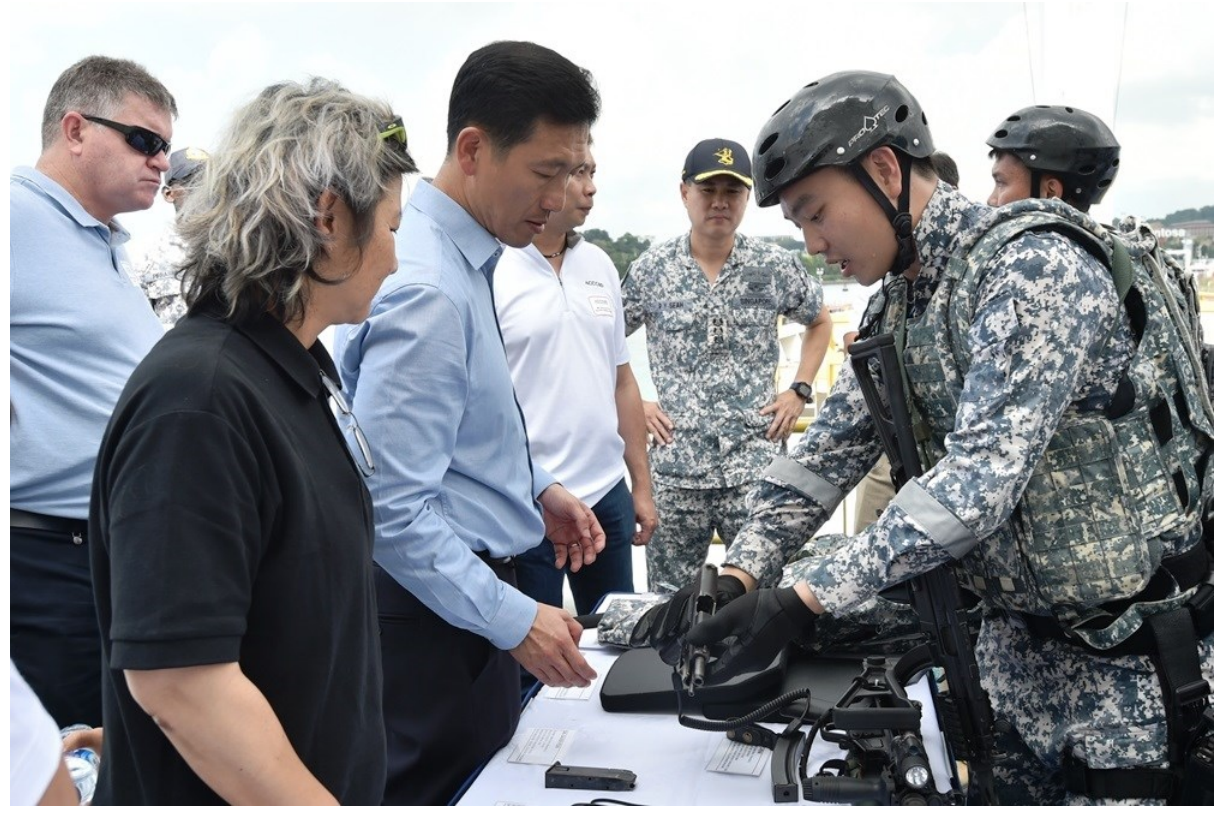
Second Minister for Defence Mr Ong Ye Kung being briefed on the equipment used by servicemen from ASSeTs.