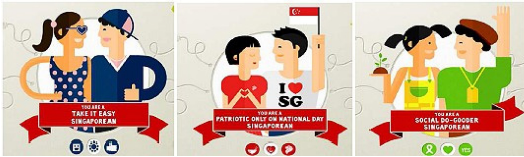
Examples of the Singaporean persona in the quiz