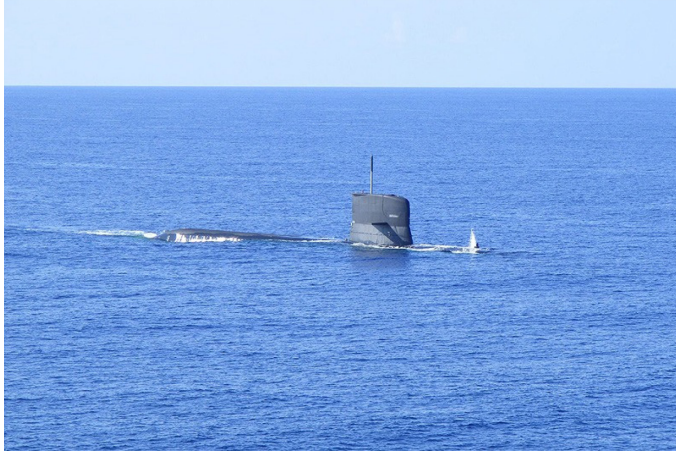
RSS Archer conducting sea trials as part of its operationalisation process following her return to Singapore.