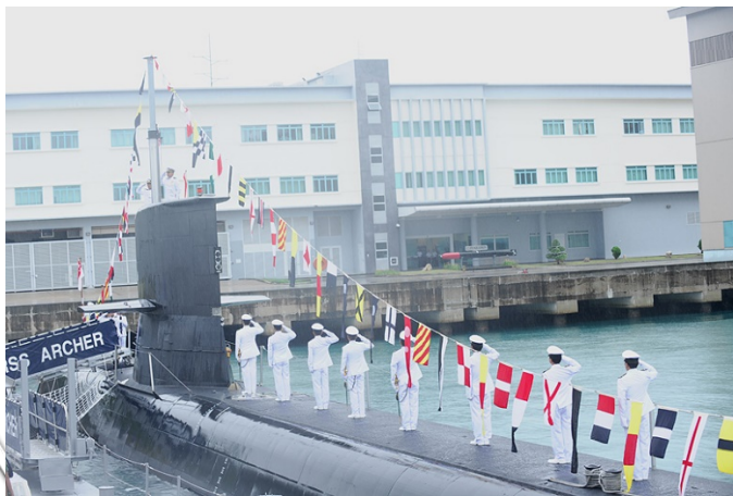
RSS Archer crew saluting to the Republic of Singapore Navy Ensign during the Commissioning Ceremony.