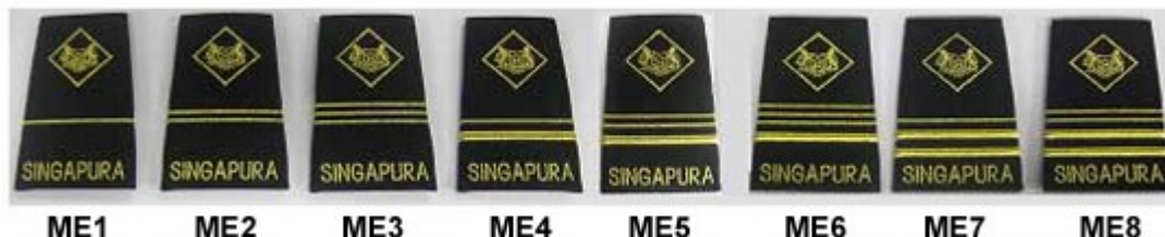
Figure 1. MDES Rank Insignia (For Number 4 Uniforms for Male & Female MEs, and Number 3 Uniforms for Male MEs)

The MEs will don the MDES ranks as shown in Figure 1 and 2 below.