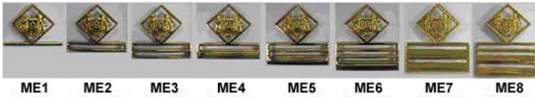
Figure 2: MDES Rank Insignia (For Number 3 Uniforms for Female MEs)

MDES Vocations and Route of Advancement. The MDES vocations cover a wide spectrum of specialisation. Taking the example of the Engineer vocation, MEs in the Air Force can specialise in fields such as Aircraft & Weapons Systems and Airfield Operations; MEs in the Army can specialise in Electronics, Armament and Automotive; and MEs in the Navy can specialise in Naval Engineering and Naval Combat Systems.