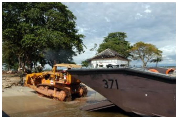
Singapore's Relief Assistance to Countries Stricken by the Earthquake and Tsunamis (30 Dec 04 - 03 Jan 05)