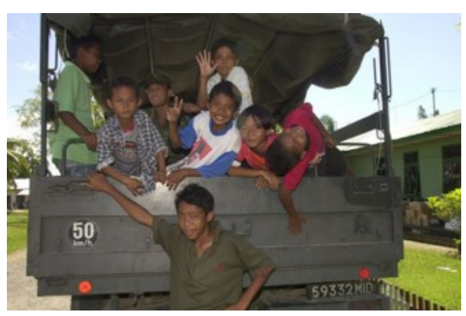
Life slowly returns to normal in Tsunami-hit Meulaboh (17 Jan 05 - 19 Jan 05)