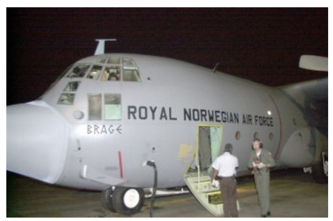
Use of Singapore's air and naval bases as additional staging and logistics points for bringing relief supplies and aid to tsunami-hit areas