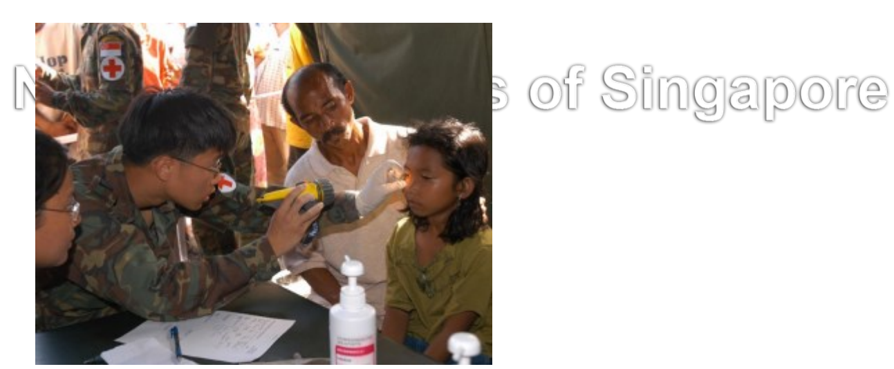
Singapore's Relief Assistance to Countries Stricken by the Earthquake and Tsunamis (03 Jan 05 - 06 Jan 05)