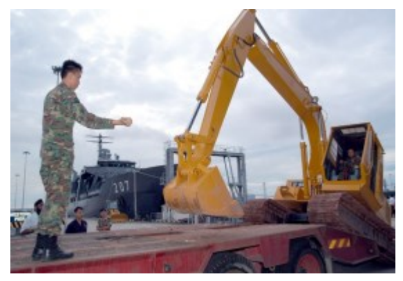
RSS Endurance, a Landing Ship Tank, being loaded with equipment. The LST will be sent to Indonesia to assist in relief efforts.

The SCDF will send two Disaster Assistance and Rescue Teams (DART) comprising 23-men each to Medan and Phuket to help search for missing persons. The teams will depart today on two RSAF C-130 aircraft from Paya Lebar Airbase. Singapore Airlines will ferry a humanitarian aid package to Phuket this evening.