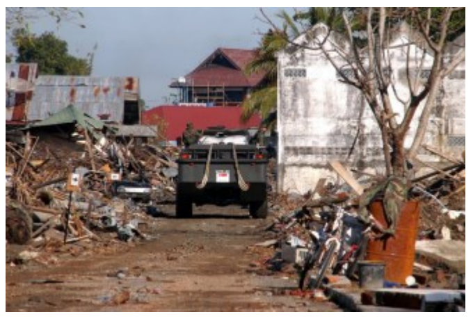
Singapore's Relief Assistance to Countries Stricken by the Earthquake and Tsunamis (07 Jan 05 - 08 Jan 05)