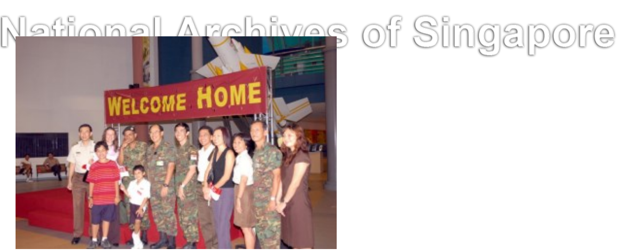
SAF Personnel and Assets Returns as Singapore's Relief Efforts in Aceh Transition from Emergency Relief to Recovery Phase