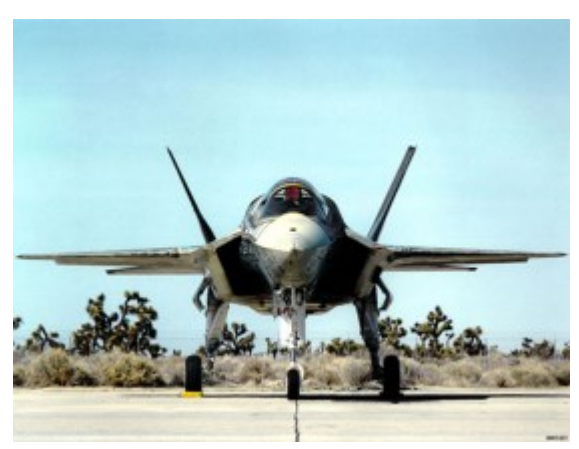
The Joint Strike Fighter, F-35.

Technology is critical to the Singapore Armed Forces. The Ministry of Defence collaborates with technologically advanced countries in its drive to make optimal use of technology as a force multiplier. The annual Defence Co-operation Committee (DCC) Meeting oversees the defence technology collaboration between the defence establishments of Singapore and the United States, including areas such as defence R&D and experimentation.