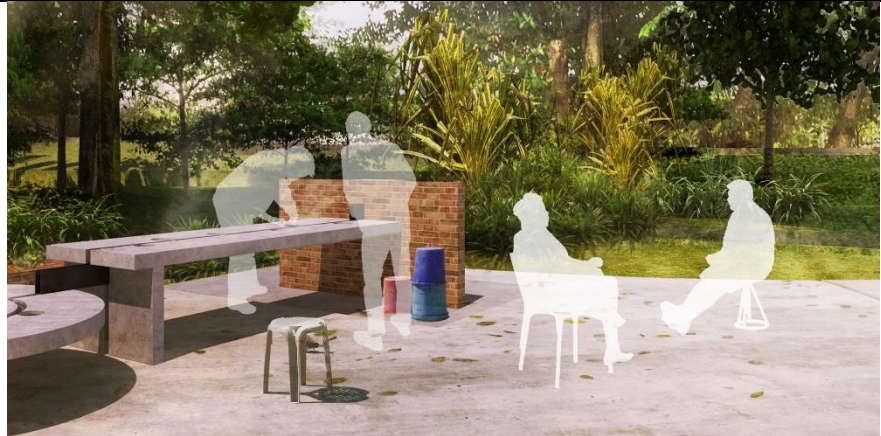
Artist's impression courtesy of NParks

Area with running hot spring water for cooking eggs