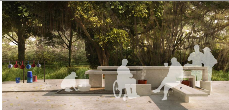
Artist's impression courtesy of NParks

Water collection point which visitors can easily access