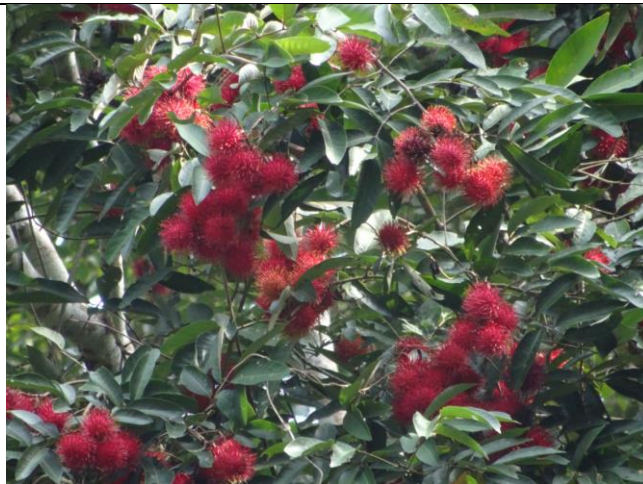
Rambutan ( Nephelium lappaceum )