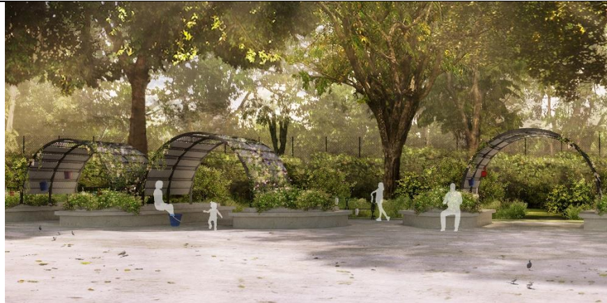
Artist's impression