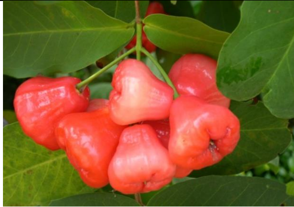
Jambu Air ( Syzygium aqueum )