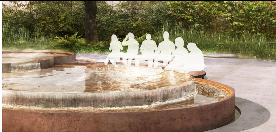
Artist's impression courtesy of NParks

Cascading pool where visitors can enjoy a foot bath in the hot spring water