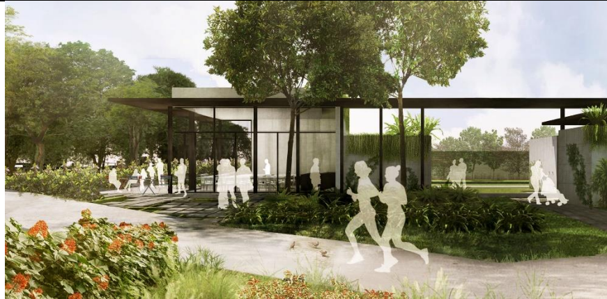
Artist's impression courtesy of NParks

New amenities, including a washroom and café