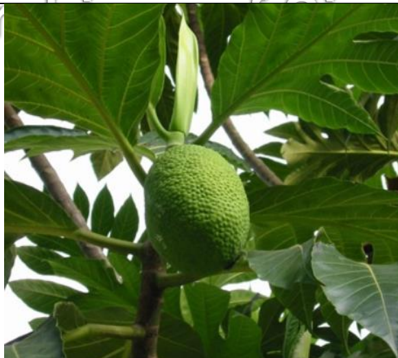
Breadfruit ( Artocarpus altilis )