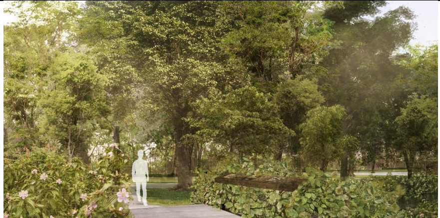
Artist's impression courtesy of NParks

Lush and comfortable environment with more trees and planting that are compatible and will add to the rustic feel of the place