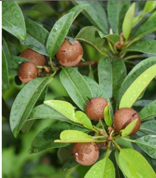
Chiku ( Manilkara zapota )