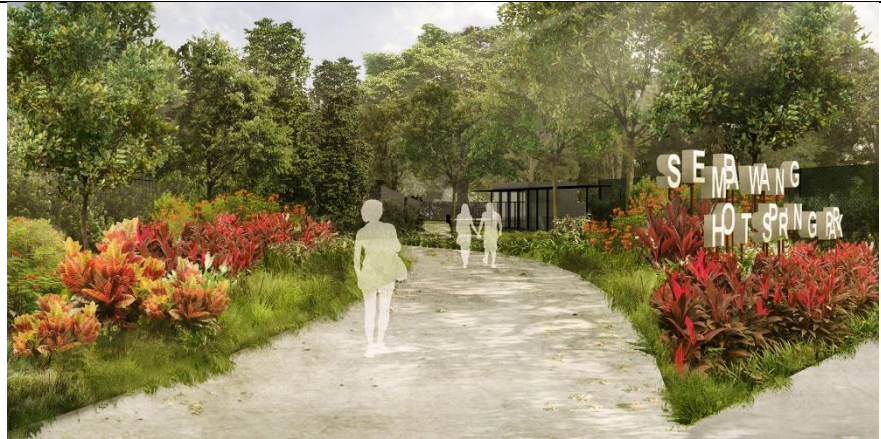
Artist's impression courtesy of NParks

Distinct and welcoming entrance, to be reminiscent of kampung gardens