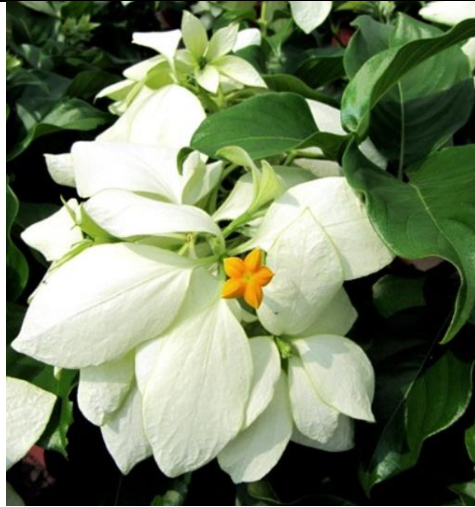
White Mussaenda ( Mussaenda philippica )