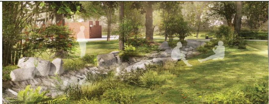
Artist's impression courtesy of NParks

Open gathering spaces next to a naturalised stream