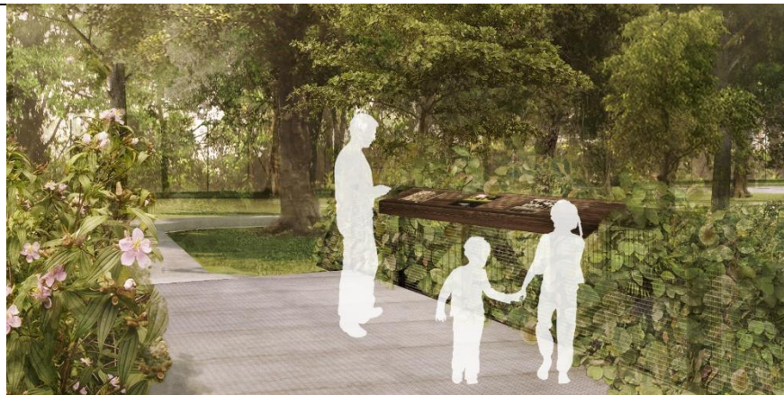
Artist's impression