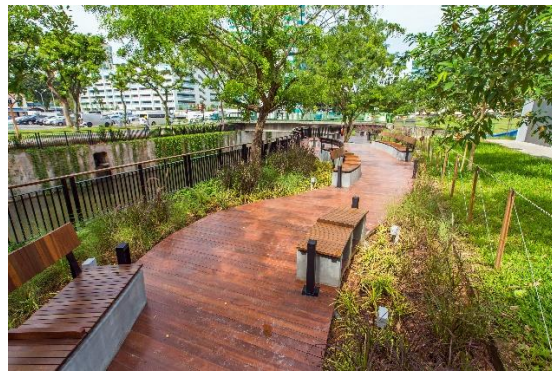
Boardwalk that brings residents closer to water