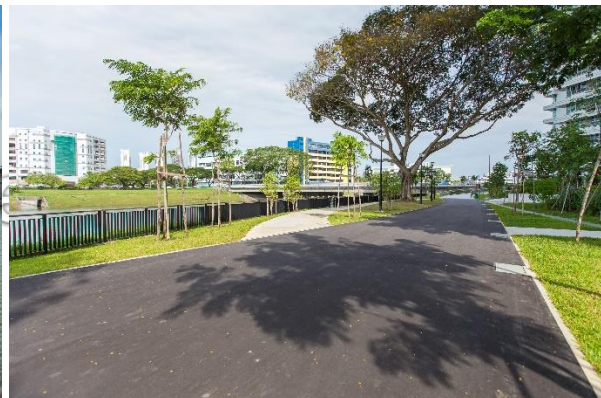
Upgraded promenade that boosts connectivity