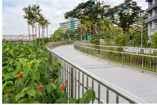
New ramp that enhances accessibility

Already, the community is abuzz with excitement over how to utilise the new recreational space. Kong Hwa School, has come forward to be the first adopter, with intentions to design a new ABC Waters Learning Trail at this site to augment the curriculum for their students. "In our efforts to inculcate care and concern for the community and environment within our students, we are happy to leverage our adoption of ABC Waters @ Kallang River as a platform for environment and citizenship education, as well as Values in Action 1 . The ABC Waters design features, such as the rain gardens, coupled with the tradition and significance of the Kallang neighbourhood, make for great learning opportunities and reinforce character and citizenship education beyond the classroom," Mr Jerry Yang, Subject Head (Character and Citizenship Education), Kong Hwa School.