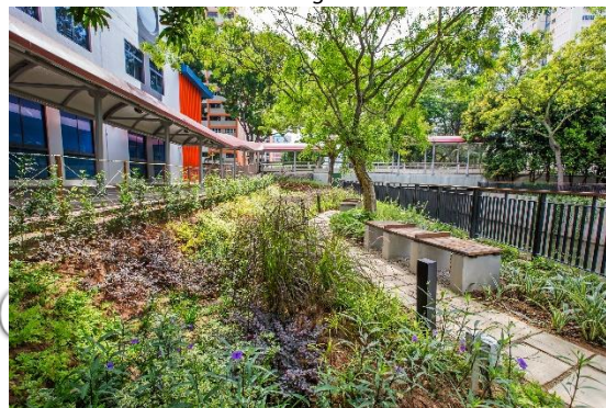
Rain garden that cleanses runoff and adds biodiversity

“ABC Waters @ Kallang River and Sungei Whampoa are really about building for the future. Both projects were planned to be integrated with upcoming development works in the vicinity, including housing and social infrastructural ones. Residents will benefit from the additional communal space, which will provide unique and picturesque backdrops for events. As both Kallang River and Sungei Whampoa flow into the Marina Reservoir – a source of water supply, we hope residents will help to play their part in keeping the waters free from litter so that all