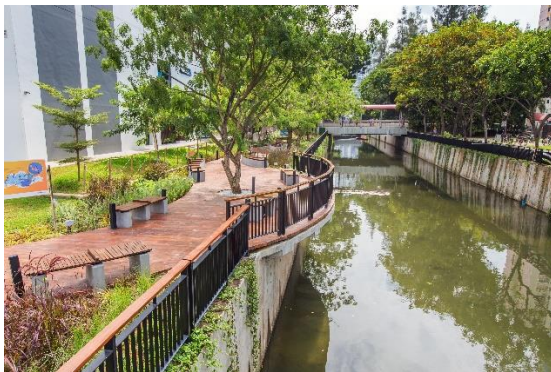
Lookout deck to take in the scenic views

A rain garden is in place to cleanse rainwater runoff from the Whampoa CC using specially-selected plants and soil media before discharging into Sungei Whampoa. Together with the lush landscaping along the canal, greenery in the neighbourhood is enhanced while residents and students gain opportunities to learn about how ABC Waters design features like rain gardens help to improve water quality and promote biodiversity. This project is slated to be officially opened in late February and is the second ABC Waters project 2 to be completed along Sungei Whampoa.