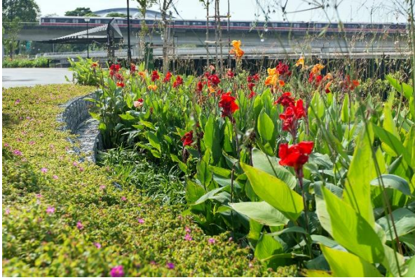
Colourful rain gardens that cleanse runoff