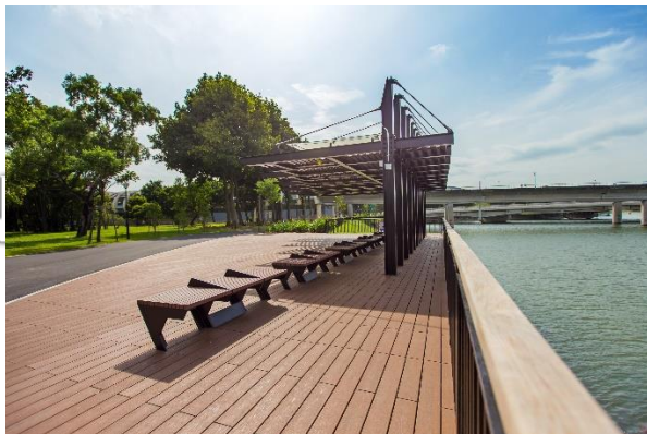
Roof decks adopting a mast-like design

As part of the facelift, PUB also upgraded an existing 3-metre wide park connector to a 15-metre wide promenade, complete with a new ramp that enhances accessibility to nearby residential blocks.