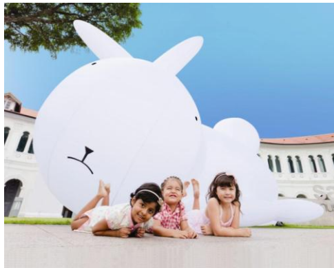
Walter by Dawn Ng.

Curated by NHB in collaboration with lille3000 at the Gare Saint Sauveur, the exhibition will feature a family-friendly contemporary art selection of interactive and engaging works by Singapore artists. This exhibition is part of a series of NHB's popular Art Garden presentations. Featuring a line-up of artists from Singapore, Art Garden examines the metaphor of the Garden as a construct that extends and mutates the essence of what is artificial and real. Inherent in Art Garden is a balance between acts of intervention and unpredictability, the orderly and the untamed, knowledge and invention. The line between reality and illusion blurs in this Art Garden journey that is full of curiosity, humour and irony.