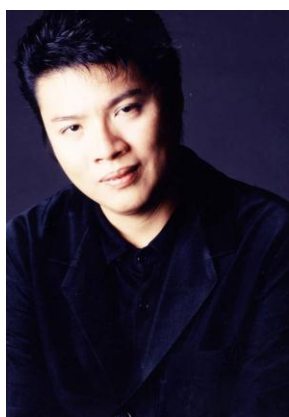
Ong Keng Sen.