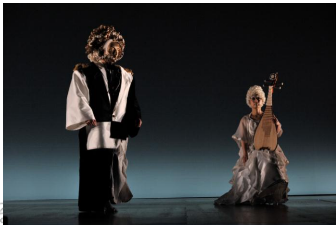
Lear Dreaming (2012).

Lear Dreaming is directed by ONG Keng Sen based on Shakespeare's King Lear , and first produced by the Japan Foundation Asia Centre in 1997. The work premiered to critical reception in Tokyo, Osaka and Fukuoka has since toured to six cities in Asia-Pacific and Europe including the Theater der Welt in Berlin. The performance will feature top-notch performing artists from Asia and will be performed in Bahasa Indonesia, Japanese, Mandarin and Korean with English subtitles.