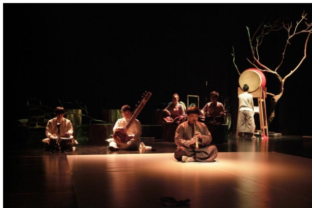
Siong Leng Musical Association

Siong Leng presents the ancient nanyin music in a multi-sensory and multi-disciplinary performance. Their first stop will take place at the beautiful historic Théâtre des Bouffes du Nord which opened in 1876, widely known as Peter Brooke's Theatre. Thereafter, the group will tour to Nantes and Châlons-en-Champagne for two more concerts.