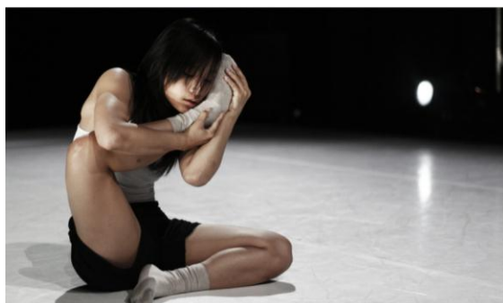
Frontier Danceland.